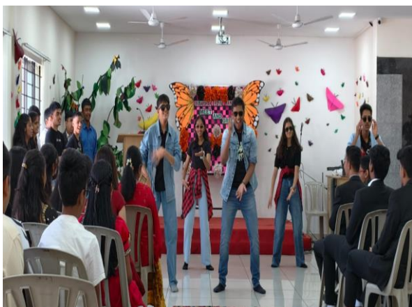
Meet And Greet- Grade 10 Farewell